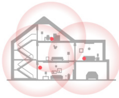
500 m 2 Coverage