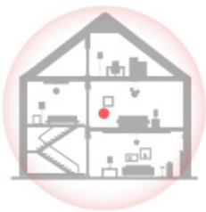
300 m 2 Coverage